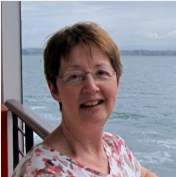
Statewide Consulting Librarian