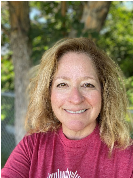
MSL Continuing Education Coordinator