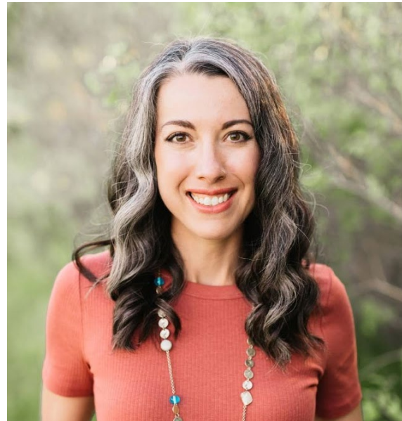
Data Coordinator Montana State Library