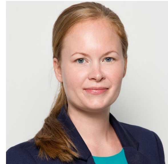
Director Customer Service Counting Opinions