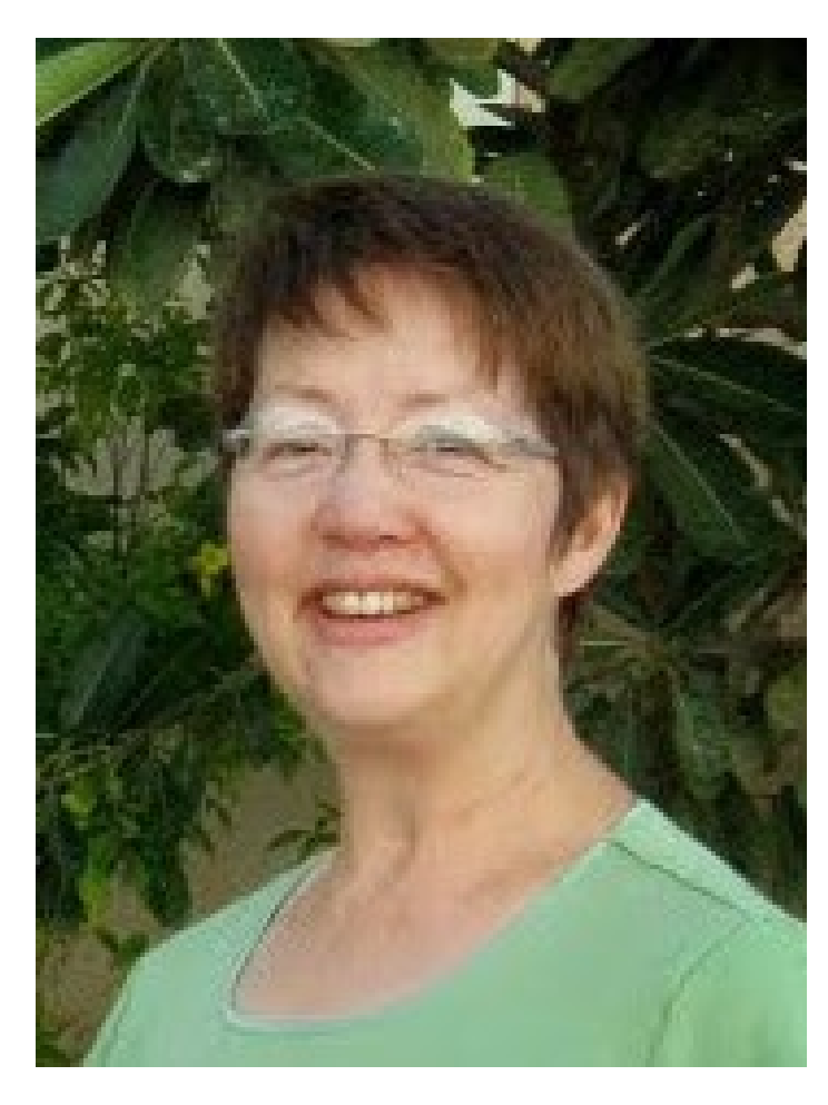
MSL Consulting Librarian