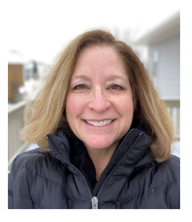
MSL Continuing Education Coordinator