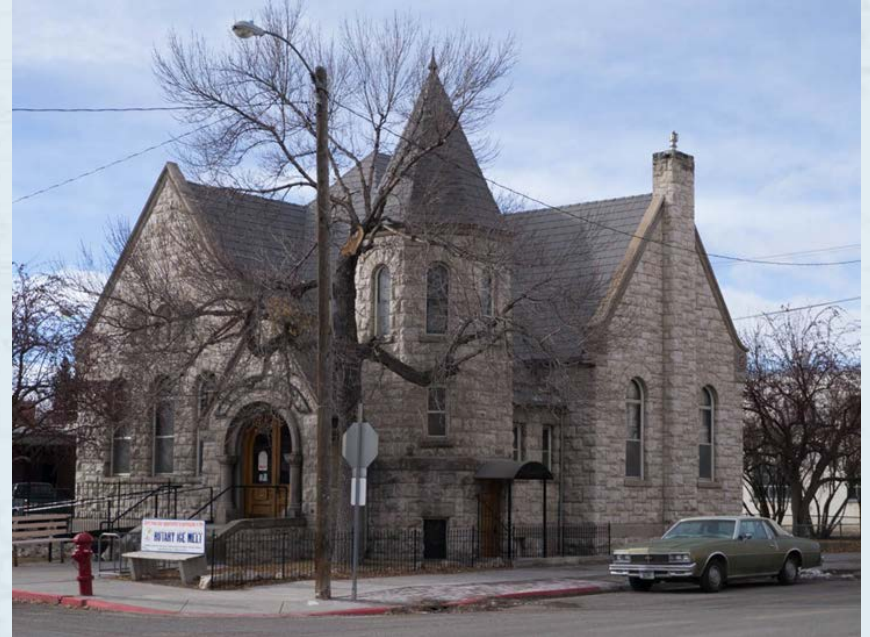
Carnegie Library, Dillon, MT