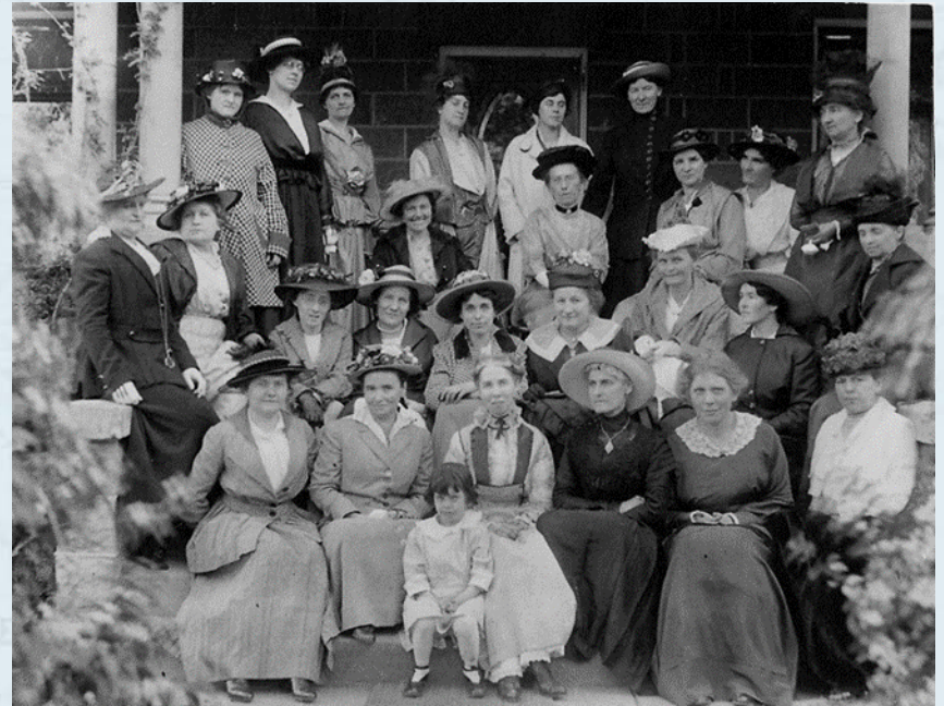
Fort Benton Women's Club