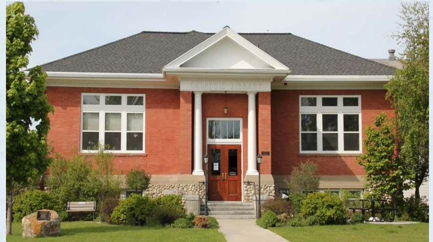
Carnegie Library, Big Timber, Montana