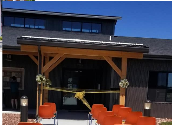
Meagher County/City Library