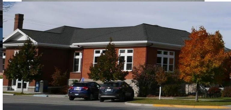
Carnegie Public Library, Big Timber