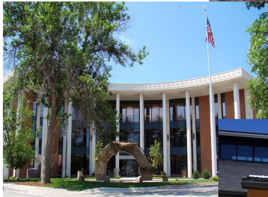
Great Falls Public Library