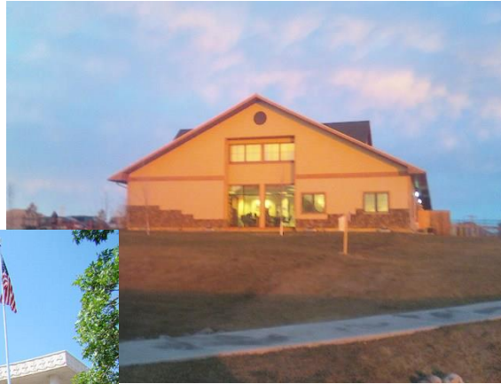
Harlowton Public Library