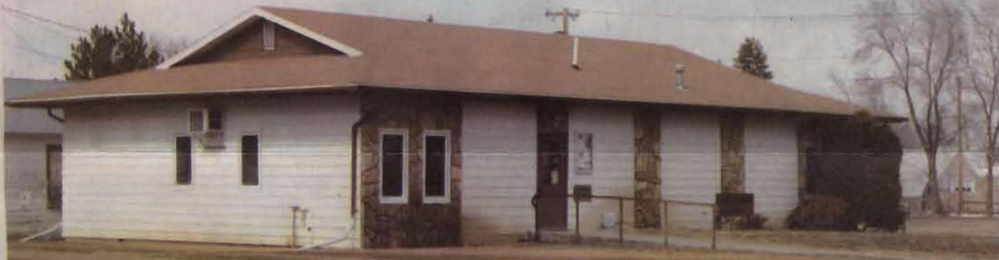
The library, pictured above, is a popular after-school stopping point for students, such as these teens from Terry High School, top right.

that will make finding books and other resources even easier.